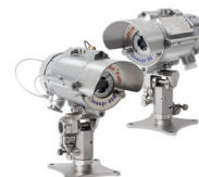
SafEye 900 Series Open Path gas detectors