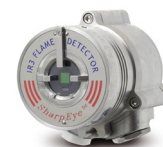
SharpEye 40/40 Series Flame detectors